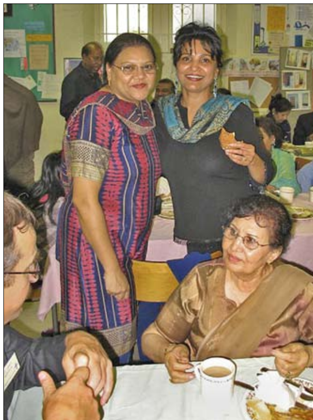
Following the Urdu/English service, worshippers gathered to share foods from both cultures.

Most people stayed for dinner, at which the menu represented both cultures and provided a perfect