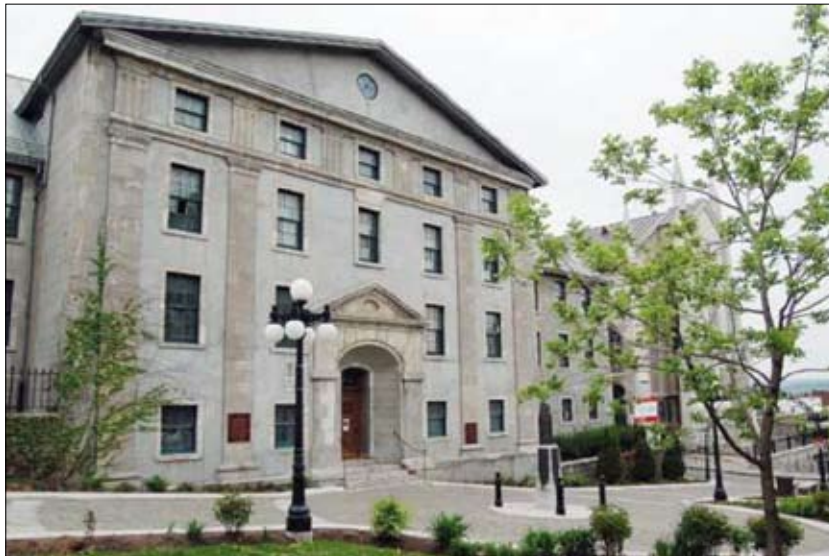
The Quebec City congregation meets in a former prison, now a library—The Morrin Centre.