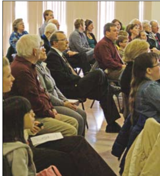
More than 60 people gathered at Clareview Recreation Centre

group before launching out into the community."