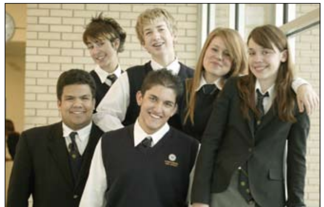
Students at Concordia High School

Students interested in the best Lutheran education need only visit www.concordiahighschool.com to begin their journey. The website has nearly all of the information a student